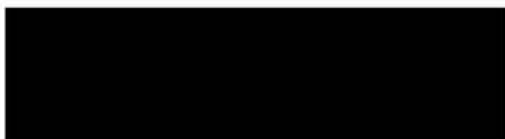
The Hon Ray Finkelstein AO QC Commissioner of the Royal Commission